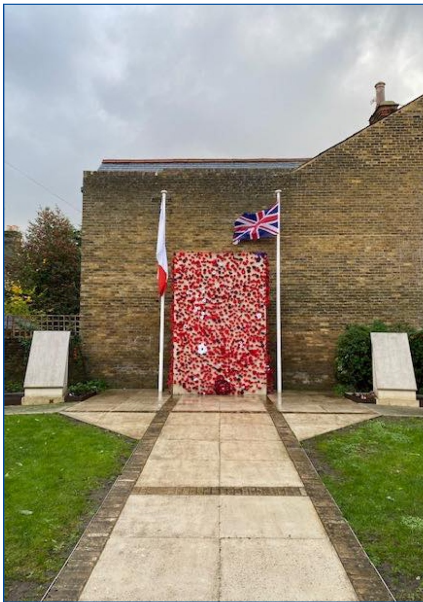
Faversham War Memorial Garden