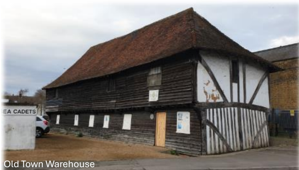
Old Town Warehouse

The Council has a number of objectives in relation to the acquirement of Town Quay and the Old Town Warehouse, which will see the revitalisation of an unused building, bringing it into community use.