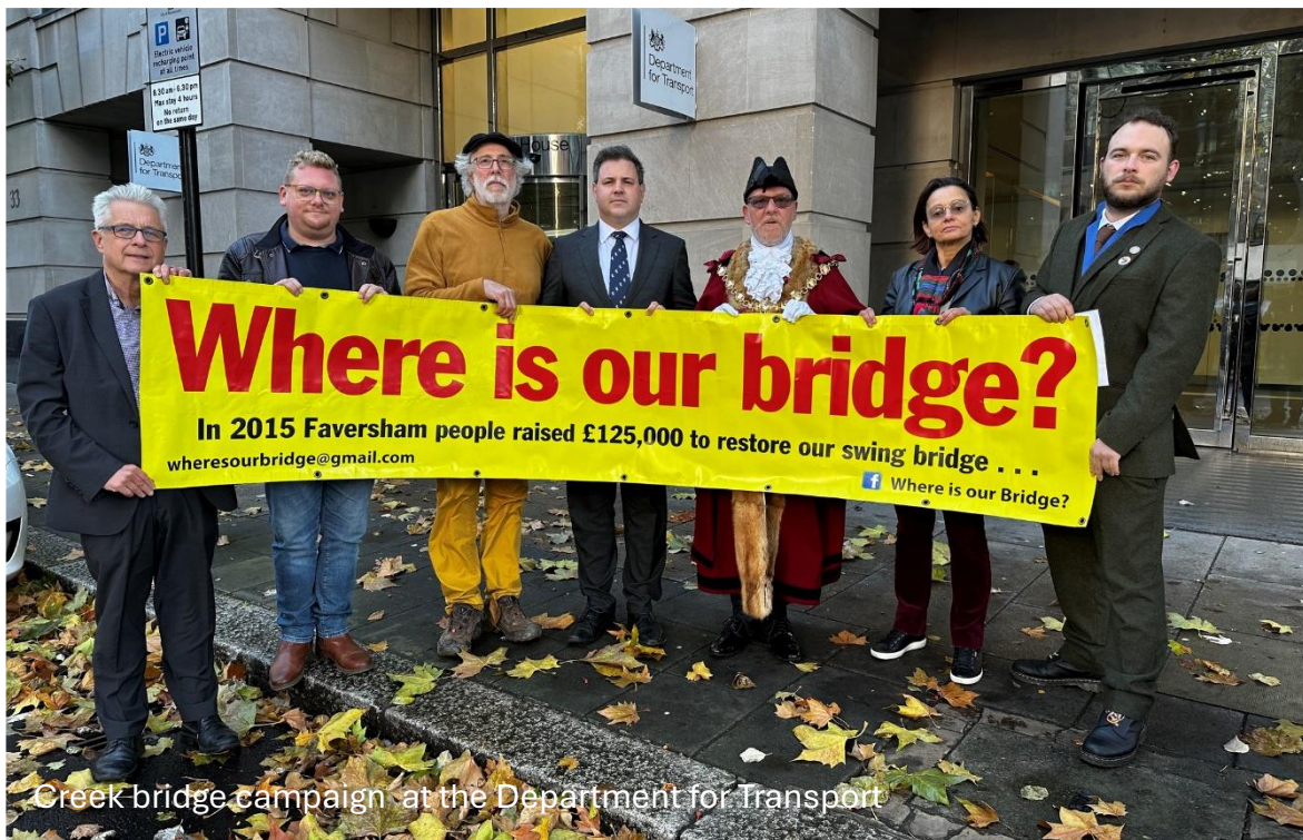
Creek bridge campaign - at the Department for Transport

FTC is committed to upholding principles of transparent, accountable, and inclusive governance, ensuring that the interests and well-being of the local community are at the forefront of its decision-making processes. The Council operates with a clear framework of policies and procedures designed to promote effective administration, financial prudence, and responsive public service. Regular meetings, open to public attendance and participation, foster a culture of transparency and engagement, allowing residents to voice their concerns and contribute to the community's development. By prioritising ethical standards and continuous improvement, FTC strives to enhance the quality of life for all its residents, maintaining a proactive stance on local issues and opportunities for growth. FTC has signed the Civility and Respect Pledge.