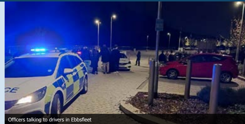
Officers talking to drivers in Ebbsfleet

The Rural Task Force and other police teams are continuing to take action against nuisance vehicles and reckless off-road riding. They recently targeted anti-social behaviour in Medway and North Kent – such as off-road riding across green spaces and large gatherings of nuisance vehicles disturbing those living nearby. Rural Task Force officers, Medway's Beat Team and special constables patrolled across green spaces in Chatham and Gillingham to identify those riding recklessly, without insurance or not displaying a licence plate. Officers spoke to a number of people – including some seen unloading off-road vehicles in preparation to use on footpaths and open spaces. A bike was seized in Hoo after it was reported being seen used anti-socially. Police issued several Section 59 warnings to motorists – which means their bikes will be seized if they are seen causing a nuisance with their vehicles again. Partners from Medway Council supported the operation.