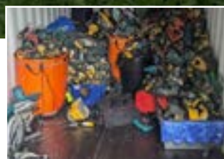
3,655 power tools seized