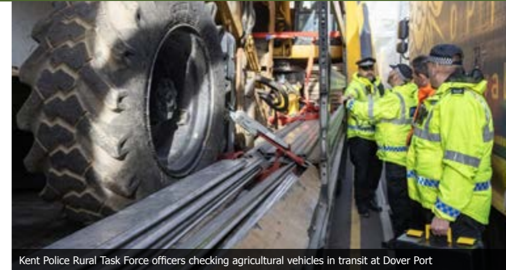
Kent Police Rural Task Force officers checking agricultural vehicles in transit at Dover Port

The Rural Task Force in Kent now has more officers who work with local communities to deal with livestock offences; anti-social behaviour; agricultural crime; poaching, illegal fishing