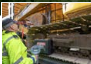
New joint forces action