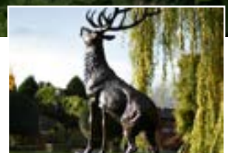
Heritage – thefts alert

Plus the latest news on rural and environmental policing in Kent