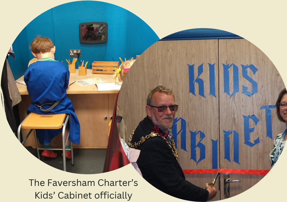
The Faversham Charter's Kids' Cabinet officially opened 31st May