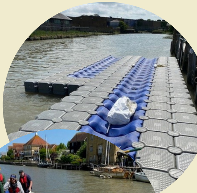
Floating pontoons installed at Front Brents Jetty at the request of the Community Boat Build and Cinque Port Rowing Club June 2023