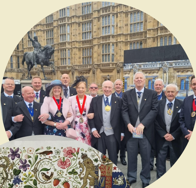
The Mayor of Faversham attended the Coronation of His Majesty King Charles III 6th May 2023