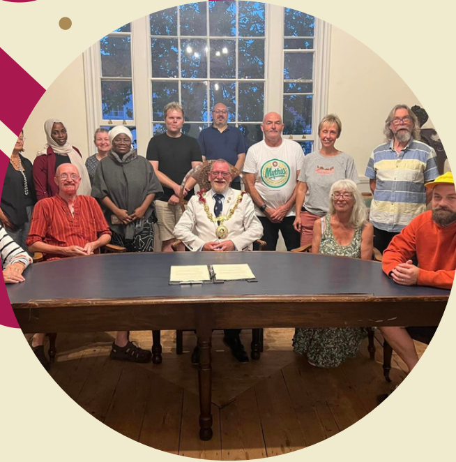
Signing of the St Nicholas Allotment Agreement with allotment officers and holders 5th September 2023