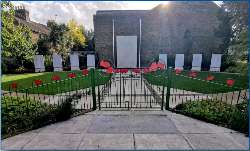
Faversham War Memorial Garden