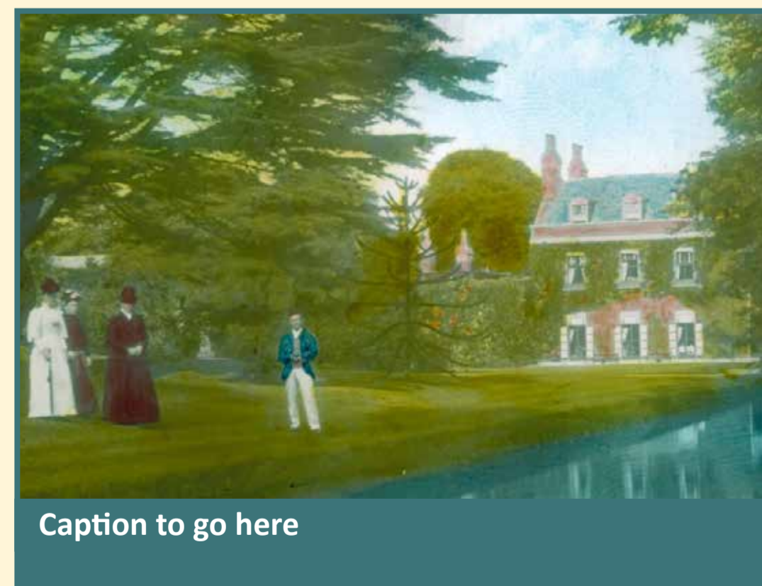
Caption to go here

There are fewer than 300 chalk streams in the world, most of them in the UK. They are typically fed by springs where clean, cool water flows from the underground chalk aquifer and provides a unique habitat for wildlife (like kingfishers and critically endangered European eels) to thrive. Sadly, many chalk streams are at risk from being lost, due to issues such as pollution and abstraction.