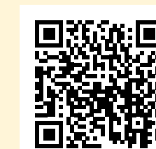
Chart Mills FavershamSociety.org/ ChartGunpowder-Mills