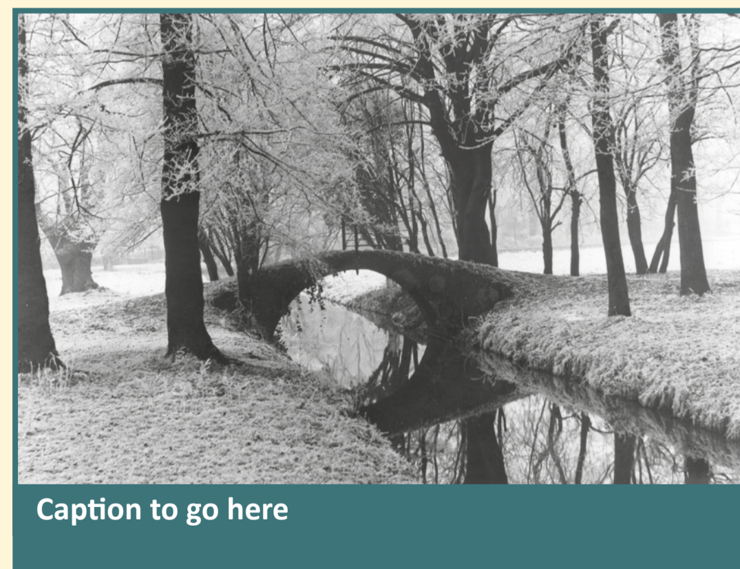
Caption to go here