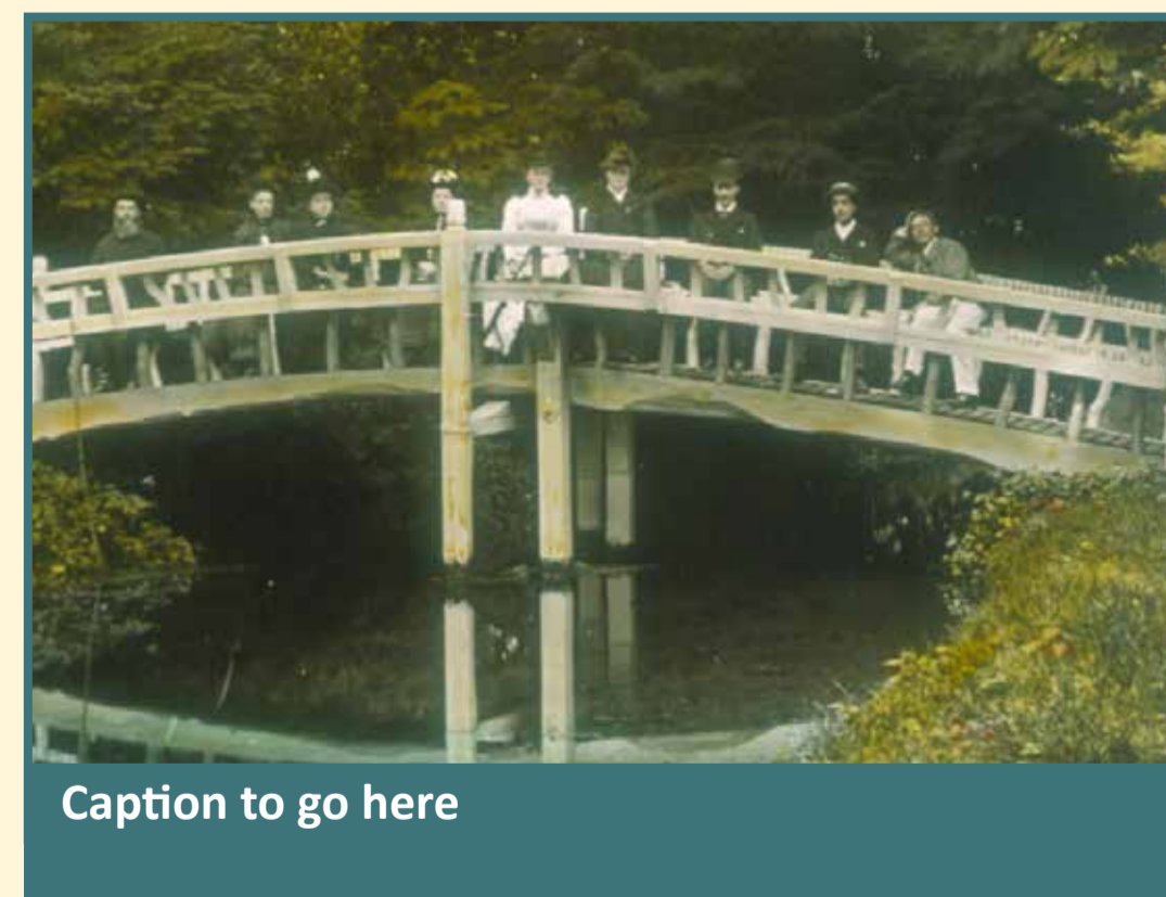
Caption to go here