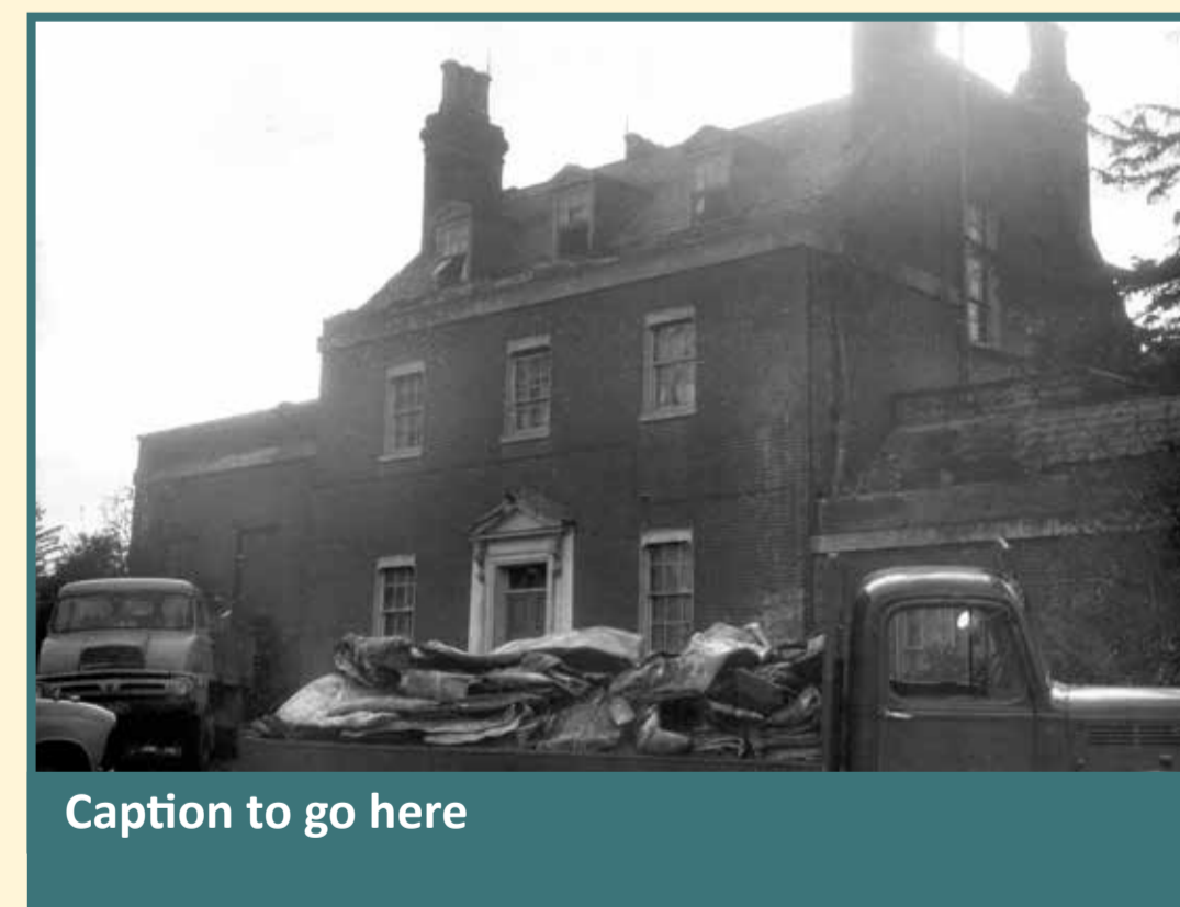
Caption to go here