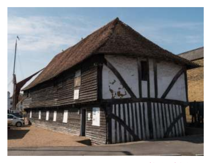
TS Hazard in Conduit Street

Open Faversham will run from Saturday 12th to Sunday 20th August and during those nine days Faversham groups and individuals, who would like to celebrate and share any aspect of our heritage, past or present, are invited to join. It is the summer holidays and although some of us will be away, many will be having a 'staycation' and families will be home with children looking to be entertained. In August Faversham attracts