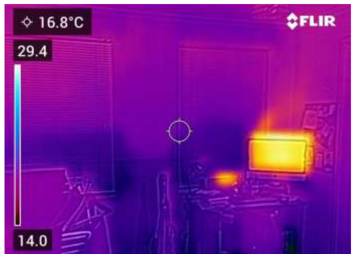
In the thermal image above, the darker areas show the draughts from the windows and the lightest areas indicate the computer screen as a heat source. The temperature scale on the left of the image shows the difference in temperatures.