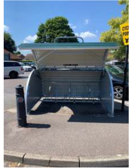
Safe secure bike storage units in Central and Institute Road car parks

The 20 mph scheme starts to make town streets safer for cycling, but needs to be supported by other initiatives that support bike use like promotions, training and bike storage. We also want to encourage safer behaviour by bike users in line with the new Highway Code.