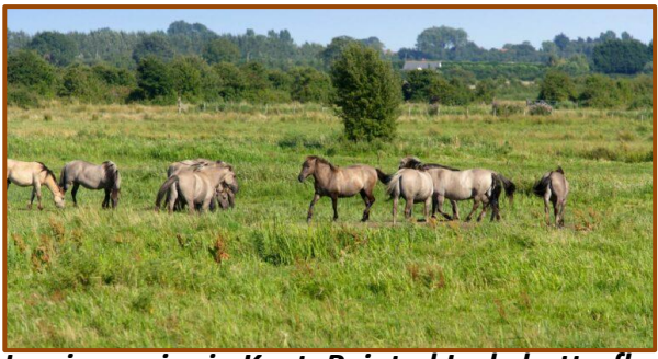
Iconic species in Kent: Painted Lady butterfly and Konik horses

Nightingales, are still at risk of being lost as breeding species.