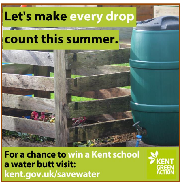
Example campaign post

<u>www.facebook.com/KentGreenAction/</u> or <u>www.twitter.com/KGA_KENT</u> for news and tips.