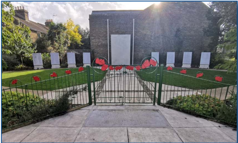
Faversham War Memorial Garden