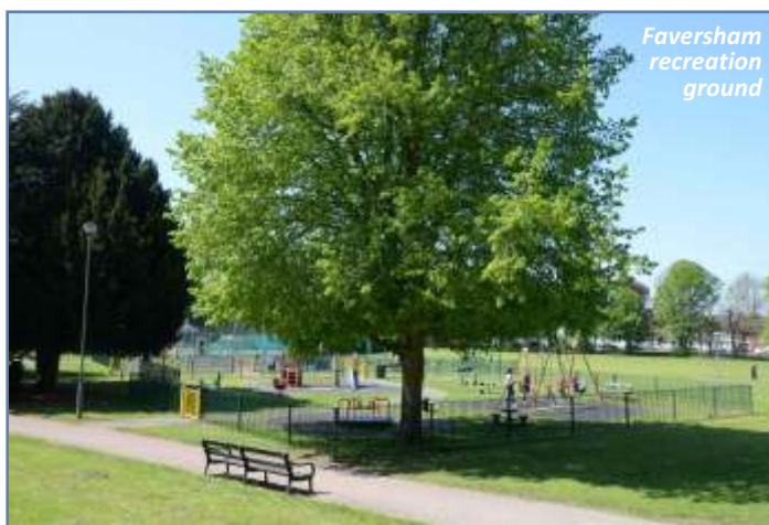
Faversham recreation ground